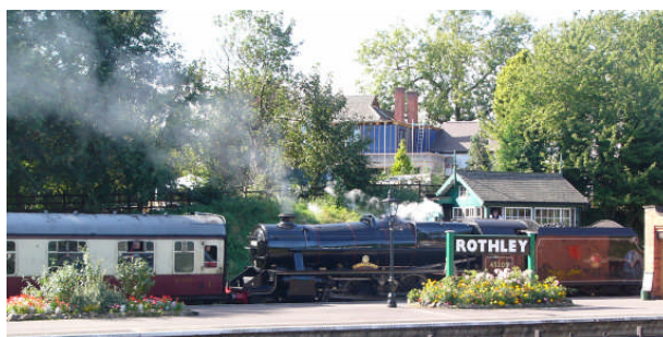
A scene from the Autumn tour on the Great Central Railway in Leicestershire

Guild autumn meeting on the Mid Norfolk Railway.